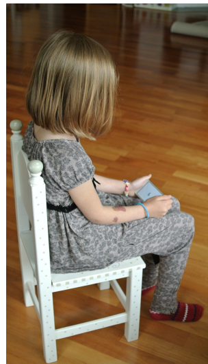
Figure 2. How to sit

The test involves observing symbols that shortly appear on the screen. The task is to tap the screen as a response to some symbols, and avoid tapping to others. The test last for 16-20 minutes and the task varies depending on your age.