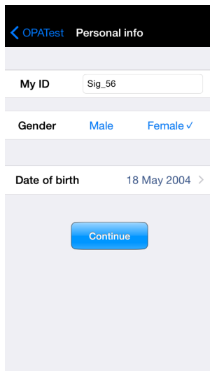
Figure 1. Example of personal info

OPATUS® CPTA is done on a smartphone (mobile). Before the test, enter an ID (a self-chosen username or an anonymous study ID), gender and birthday. One should sit in a regular chair without swivel, tilt or armrest in a room without disturbances. The mobile is held with both hands and with the hands in the knee as shown in the figure 2. Use the thumb of your dominant hand.